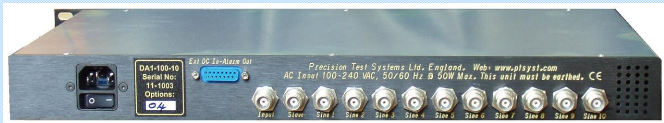
DA1-100-10-100kHz Rear view (with option 04 TNC Connectors).

Precision Test Systems also manufactures the PTS50 and DA1010 series of distribution amplifiers. These models are lower cost alternatives to the DA1-100-10-100kHz but still give very good performance.