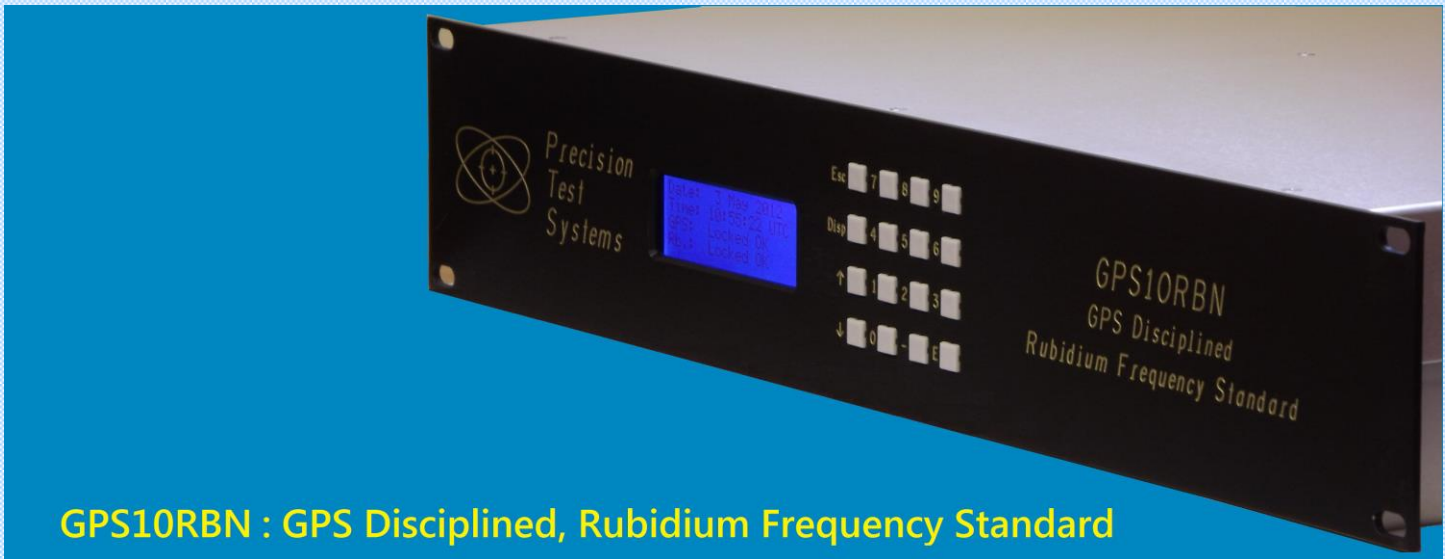
GPS10RBN : GPS Disciplined, Rubidium Frequency Standard