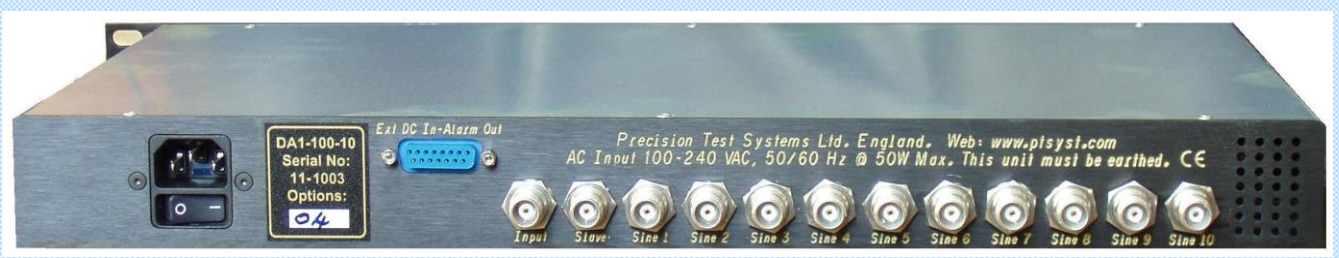
Amplifier Rear view (with option 04 TNC Connectors).

Precision Test Systems also manufacturers the PTS50 and DA1010 series of distribution amplifiers. These models are lower cost alternatives but still give very good performance.