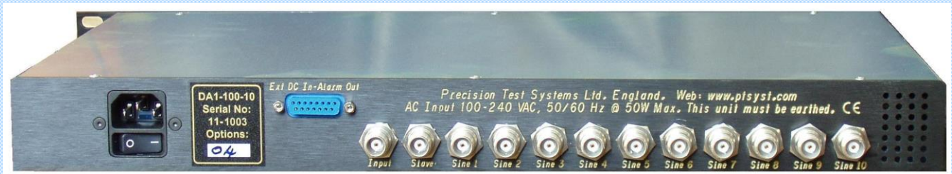
Amplifier Rear view (with option 04 TNC Connectors).

Precision Test Systems also manufactures the PTS50 and DA1010 series of distribution amplifiers. These models are lower cost alternatives but still give very good performance.