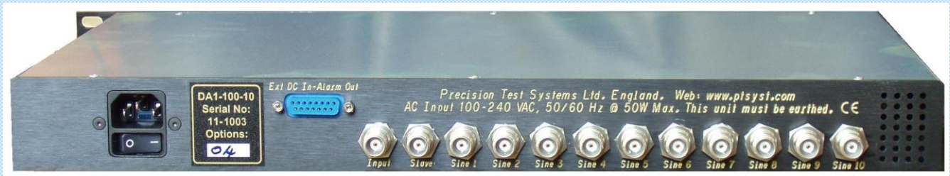
Amplifier Rear view (with option 04 TNC Connectors).

Precision Test Systems also manufactures the PTS50 and DA1010 series of distribution amplifiers. These models are lower cost alternatives but still give very good performance.