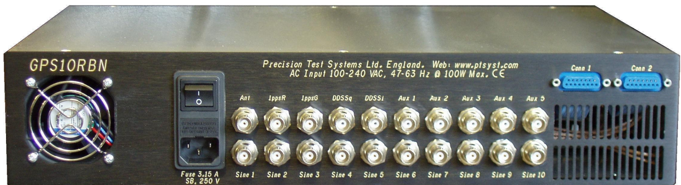
GPS10RBN-26 Rear panel

The RS232 interface allows complete control and interrogation of the GPS10RBN-26. Optional USB or Ethernet adapters allows the GPS10RBN-26 to be controlled via the USB port of the PC or from a network.