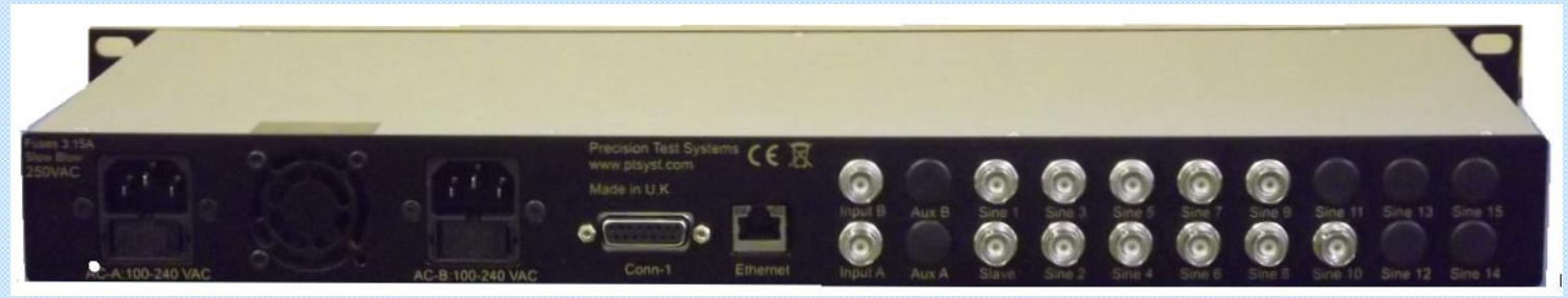
DA1-150-10-E Rear view

Precision Test Systems also manufacturers the PTS50, DA1010 and DA1-100 series of distribution amplifiers. These models are lower cost alternatives to the DA1-150-10-E but still give very good performance.