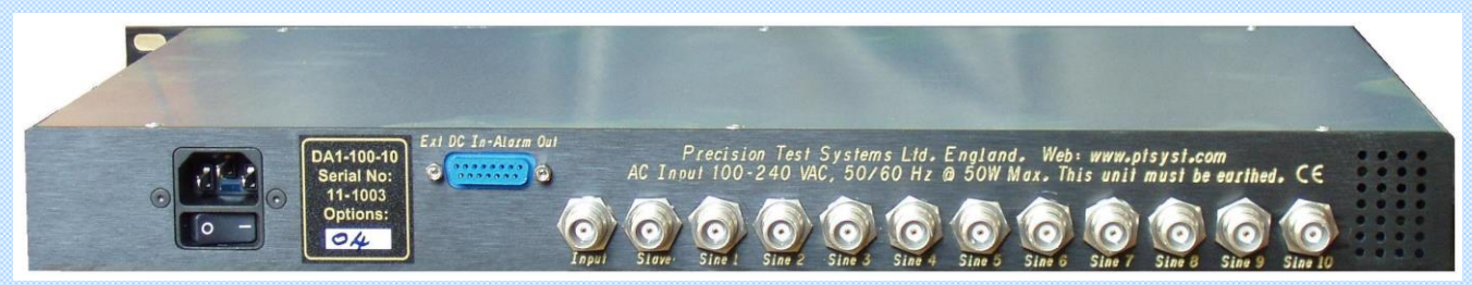
DA1-100-10 Rear view (with option 04 TNC Connectors). 1U case type. 2U case is double the height.

Precision Test Systems also manufacturers the PTS50 and DA1010 series of distribution amplifiers. These models are lower cost alternatives to the DA1-100-10 but still give very good performance.