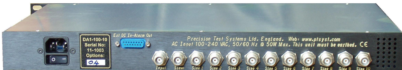
DA1-100-10-1MHz Rear view (with option 04 TNC Connectors).

Precision Test Systems also manufactures the PTS50 and DA1010 series of distribution amplifiers. These models are lower cost alternatives to the DA1-100-10-1MHz but still give very good performance.