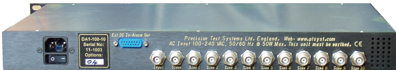
DA1-100-10-160MHz Rear view (with option 04 TNC Connectors).

Precision Test Systems also manufacturers the PTS50 and DA1010 series of distribution amplifiers. These models are lower cost alternatives to the DA1-100-10-160MHz but still give very good performance.