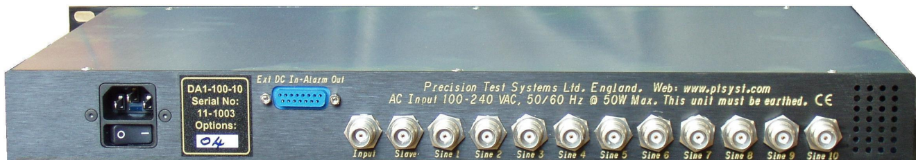
DA1-100-10-13MHz Rear view (with option 04 TNC Connectors).

Precision Test Systems also manufactures the PTS50 and DA1010 series of distribution amplifiers. These models are lower cost alternatives to the DA1-100-10-13MHz but still give very good performance.