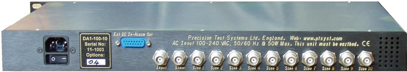
DA1-100-10-100 kHz Rear view (with option 04 TNC Connectors).

Precision Test Systems also manufactures the PTS50 and DA1010 series of distribution amplifiers. These models are lower cost alternatives to the DA1-100-10-100 kHz but still give very good performance.