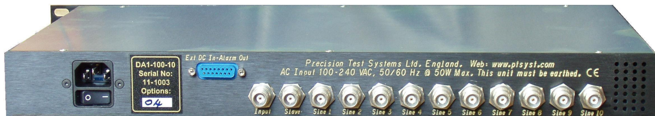
DA1-100-10-150MHz Rear view (with option 04 TNC Connectors).

Precision Test Systems also manufacturers the PTS50 and DA1010 series of distribution amplifiers. These models are lower cost alternatives to the DA1-100-10-100MHz but still give very good performance.